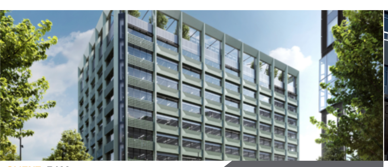
CLIENT: BAM DURATION: 108 WEEKS