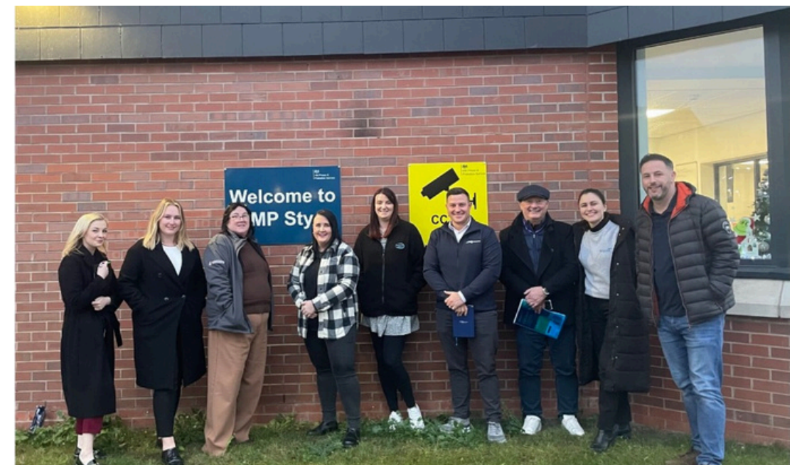
HMP Styal Prison Visit

Murraywood Construction is proud to support and participate in events like this that promote construction as a positive and achievable career path. We look forward to returning to HMP Styal in March to reconnect with the participants and celebrate their achievements upon completing the programme!